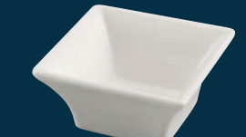
SQUARE SAUCE DISH Size: 3" (3 oz.) No.51 03 07 92