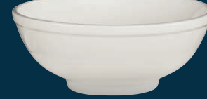
MIDDLE RIM SOUP BOWL Size: 8 1/4" (48 oz.) No.34 55 21 20