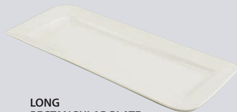
LONG RECTANGULAR PLATE No.21 43 25 18 - Size: 9 7/8" x 4 1/8" No.22 43 31 18 - Size: 12 1/4" x 4 3/4" No.23 43 39 18 - Size: 15 3/8" x 5 7/8"