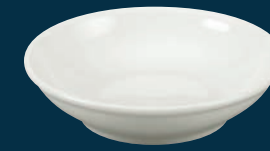
SAUCE DISH Size: 3 1/2" (2 oz.) No.50 64 09 01