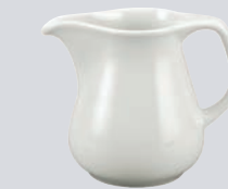
CREAMER No.64 01 16 92 - Vol: 6 oz.