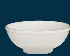
MIDDLE RIM SOUP BOWL Size: 6" (16 oz.) No.32 55 15 20