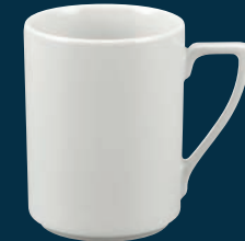
MUG No.53 15 33 58 - Vol: 11 oz.