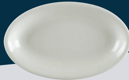
OVAL DEEP PLATE No.25 05 28 26 - Size: 11" x 6 3/4" No.26 05 32 26 - Size: 12 1/2" x 7 3/4" No.27 05 37 26 - Size: 14 1/2" x 8 3/4"