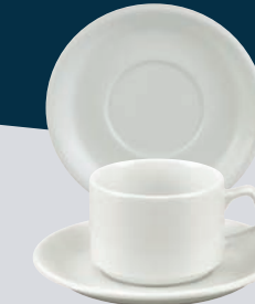
TEA CUP SAUCER No.56 65 16 01 - Vol: 5 oz. No.57 60 14 02 - Size: 5 1/2"