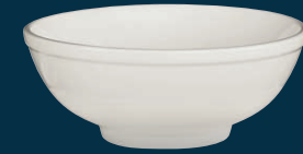
MIDDLE RIM SOUP BOWL Size: 7 1/2" (38 oz.) No.33 55 19 20