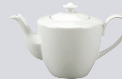
TEA POT No.61 01 45 90 - Vol: 14 oz. No.62 01 65 90 - Vol: 20 oz.