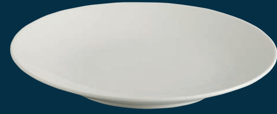
FLAT ROUND PLATE No.8 58 16 80 - Size: 6 1/4" No.9 58 18 80 - Size: 7" No.10 58 22 80 - Size: 8 1/2" No.11 58 26 80 - Size: 10 1/4" No.12 58 28 80 - Size: 11" No.13 58 31 80 - Size: 12"