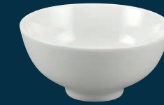
SAUCE BOWL No.48 59 09 01 - Size: 3 1/2" (4 oz.) No.49 59 10 01 - Size: 4" (6 oz.)