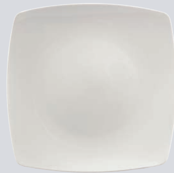
SQUARE FLAT PLATE No.28 39 18 15 - Size: 7 1/8" No.29 39 21 15 - Size: 8 1/4" No.30 39 25 15 - Size: 10" No.31 39 27 15 - Size: 10 3/4"

Distribution: Minh Long Fine Porcelain c/o Gordon Management, Inc. 60 Clyde Road, Somerset, New Jersey 08873