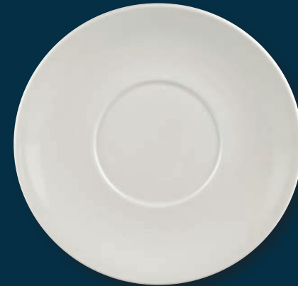
BOWL SAUCER Size: 9" No.38 60 23 27