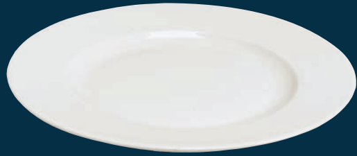
ROUND PLATE No.1 58 15 85 - Size: 6" No.2 58 18 85 - Size: 7" No.3 58 20 85 - Size: 7 3/4" No.4 58 22 85 - Size: 8 1/2" No.5 58 25 85 - Size: 9 3/4" No.6 58 28 85 - Size: 11" No.7 58 31 85 - Size: 12"