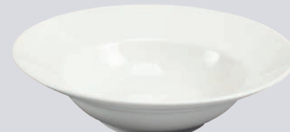
DEEP SOUP PLATE No.41 63 23 02 - Size: 9" (12 oz.) No.42 63 27 02 - Size: 10 1/2" (18 oz.) No.43 63 31 02 - Size: 12" (28 oz.)