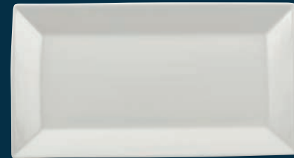
RIM RECTANGULAR PLATE No.24 46 33 04 - Size: 13" x 7"