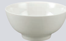
HIGH BOWL Size: 7 3/4" (50 oz.) No.40 07 20 89