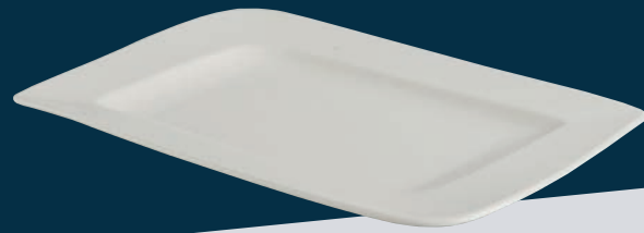
RECTANGULAR PLATE No.19 43 27 17 - Size: 11 3/4" x 7 1/8" No.20 43 33 17 - Size: 13" x 9"