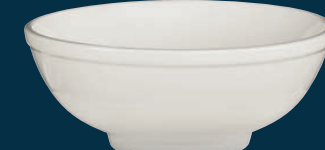
MIDDLE RIM SOUP BOWL Size: 8 1/2" (52 oz.) No.35 55 22 20