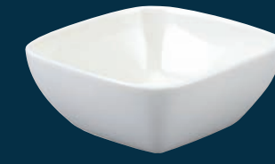
SQUARE BOWL No.45 03 11 69 - Size: 4 1/2" (9 oz.)