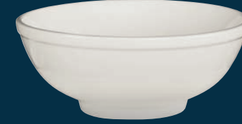
MIDDLE RIM SOUP BOWL Size: 9 1/2" (70 oz.) No.37 55 24 20