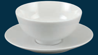
RICE BOWL No.46 03 11 99 - Size: 4 1/4" (8 oz.) BOWL SAUCER No.47 58 15 86 - Size: 5 3/4"