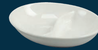
TWO DIVIDED SAUCE DISH No.44 23 10 04 - Size: 4 1/8"

Quality Hospitality Dinnerware Since 1970