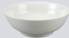
LOW BOWL Size: 7 3/4" (36 oz.) No.39 07 20 88