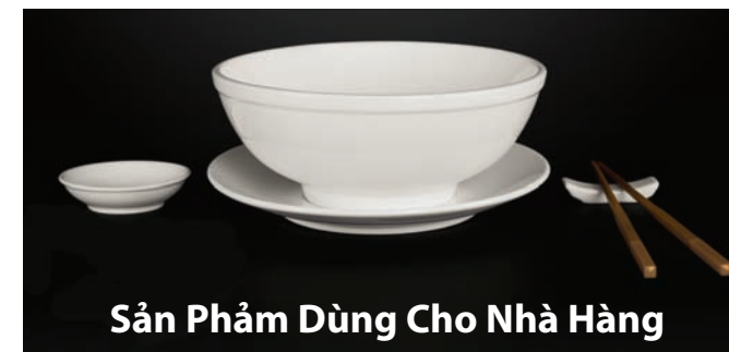
Sản Phẩm Dùng Cho Nhà Hàng Quality Hospitality Dinnerware

TPK Enterprises, LLC • 80 Berkshire Road • West Hartford, CT 06107