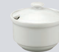
SUGAR BOWL No.63 03 08 97 - Vol: 4 oz.