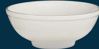
MIDDLE RIM SOUP BOWL Size: 9" (62 oz.) No.36 55 23 20