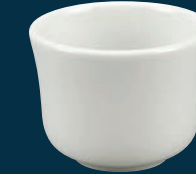
TEA CUP w/out HANDLE No.52 02 16 63 - Vol: 5 oz.