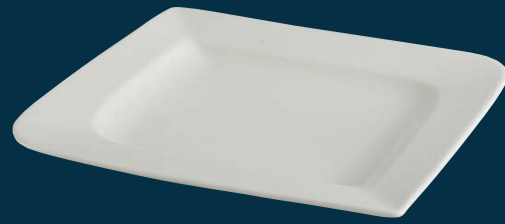
SQUARE PLATE No.14 42 18 12 - Size: 7 1/4" No.15 42 22 12 - Size: 8 7/8" No.16 42 25 12 - Size: 10" No.17 42 27 12 - Size: 10 7/8" No.18 42 31 12 - Size: 12 3/8"