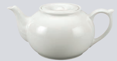
LOW TEA POT No.65 01 07 91 - Vol: 24 oz. No.66 01 11 91 - Vol: 36 oz.