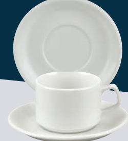
TEA CUP SAUCER No.58 65 22 01 - Vol: 7 oz. No.59 65 25 01 - Vol: 9 oz. No.60 60 16 02 - Size: 6 1/4"