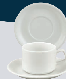
TEA CUP SAUCER No.54 65 10 01 - Vol: 3 oz. No.55 60 12 02 - Size: 4 1/2"